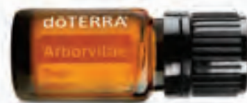
ARBORVITAE ESSENTIAL OIL SEE PAGE 8